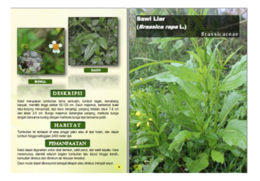
Figure 2 Final cover after revision

In the Foreword section, table of contents, introduction, utilization of survival plants and recognizing survival plants, the writing uses Times New Roman letters with size 14 and bold form with Title in the section using capital letters. In the