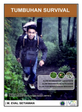
Figure 1 Cover the initial draft

The final product that has passed several revisions was the main product of the results of development research conducted by the researchers. The book presentation includes the outer title sheet and the inner title sheet using Elephant letters of varving sizes. The headline of 'Survival Plants' uses the Elephant letter with a size of 60. In writing the author's name uses the Elephant letter with a size of 22. Writing plants explorations using the Elephant letter with a size of 10. On the back cover used the size of the letter 25 for the writing 'Survival Plants'. A brief illustration of the book on the back covers using the Bell MT letters with the size of 12. On the middle cover uses the Arial letter with the size of 12 for the author's name and size 24 for writing 'Plant Survival'. The inside cover of the book uses Times New Roman letters with different writing sizes based on the writing. In writing the title 'SURVIAL PLANTS' uses the letter of size 36, for writing 'plant exploration' uses letters size 14, and for writing the names of writers, editors and universities use letters with size 24. The following cover illustrations in popular scientific books with the title 'Survival Plants '.